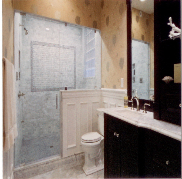
Starfire glass gives your shower crystal clarity.