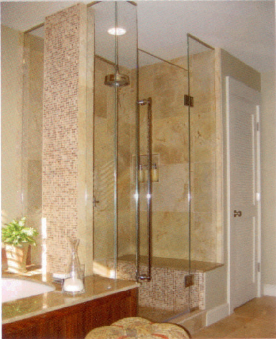
Use Portals™ hardware to enhance the utmost look and feel of your shower.