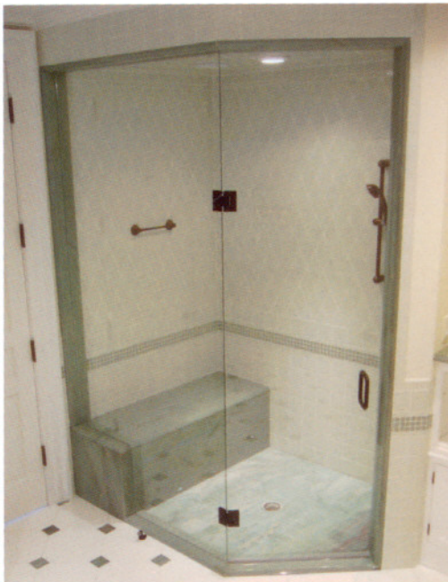
This truly frameless (buried track) offers the cleanest look.